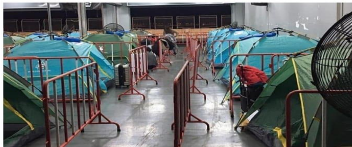
[Photo 1: An isolation area assigned for the Thai migrant workers returning from South Korea during the Covid Pandemic in Buriram Province]

Medical isolation, especially when enforced for extended periods, can have significant effects on personal rights. Some of the effects of personal rights violation caused by medical isolation might lead to feelings of loneliness, anxiety, depression, and stress. Human beings are social creatures, and social interactions are essential for maintaining mental well-being. When deprived of these interactions, individuals can experience a decline in their mental health.